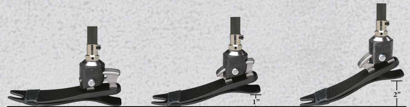
No heel/flat soled shoes Lowest setting