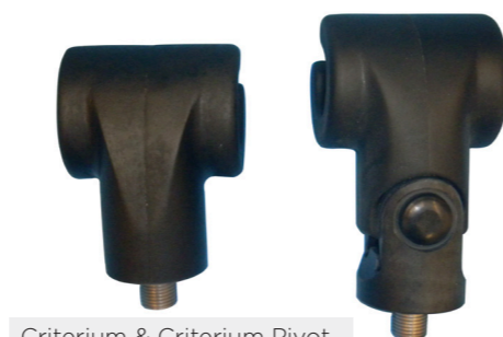
Criterion & Criterion Pivot

The Criterion Pivot Short is for children and has a wedge design. It features integral radial, and an ulnar pivoting action that provides greater versatility, control and safety for the rider.