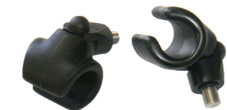
Criterion Pivot Short