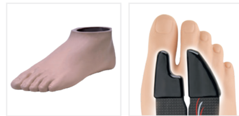
Mid profile foot shell