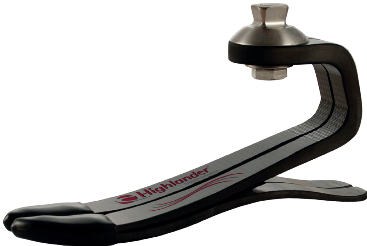
Sandal toe: sizes 22-28cm only