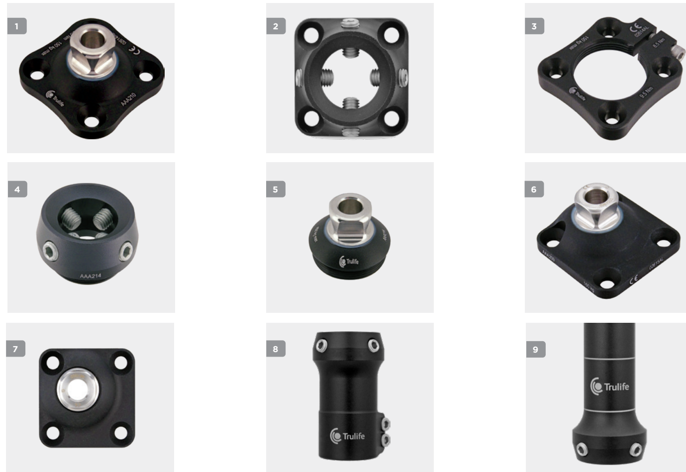
Aluminium 30mm Structural Components